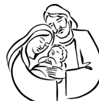
Christmas Season Schedule